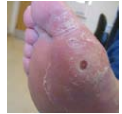
Overtly dry skin can lead to deep cracks in the skin and could lead to a foot ulcer

Athlete's foot infections should be treated immediately so they do not develop into a more serious infection. Over-the-counter ointments and powders may be used. Be sure to treat between the toes and follow the directions for a full course of treatment in order to prevent a recurrence.